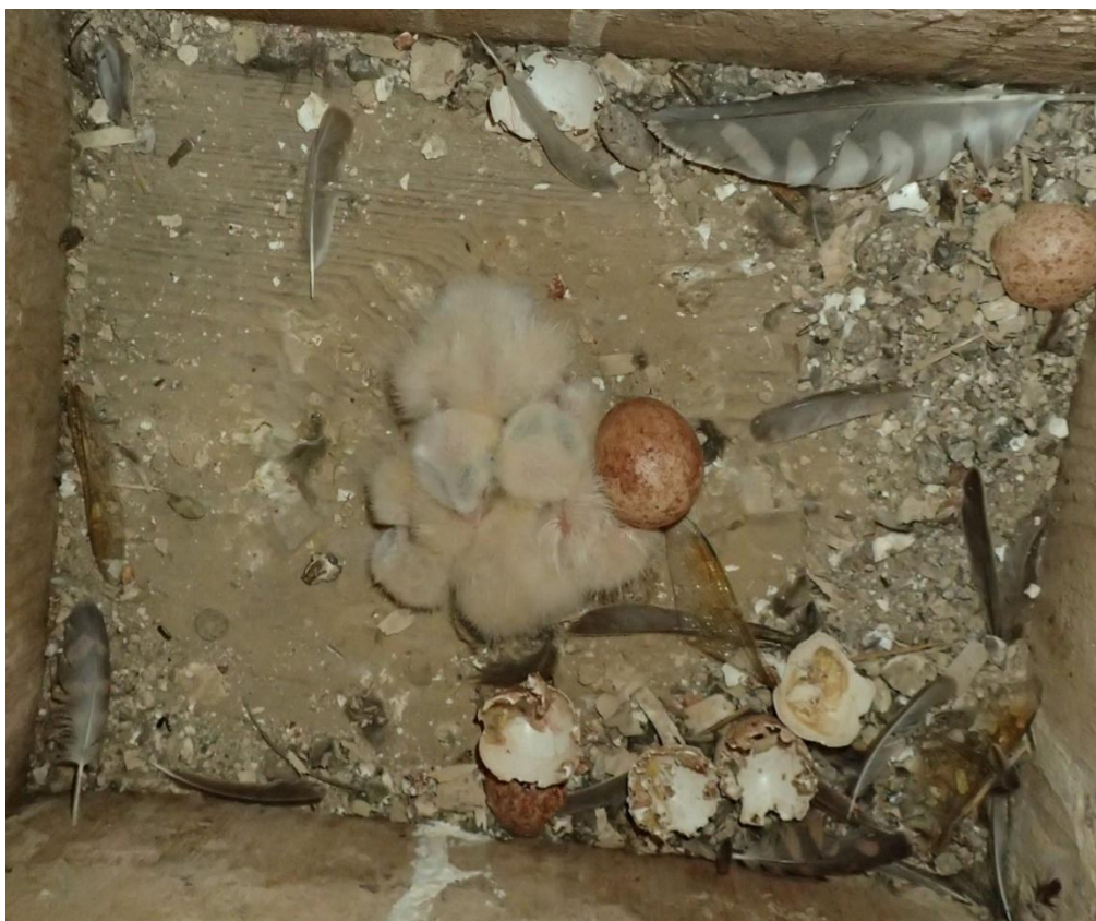
4 young fledged from this box