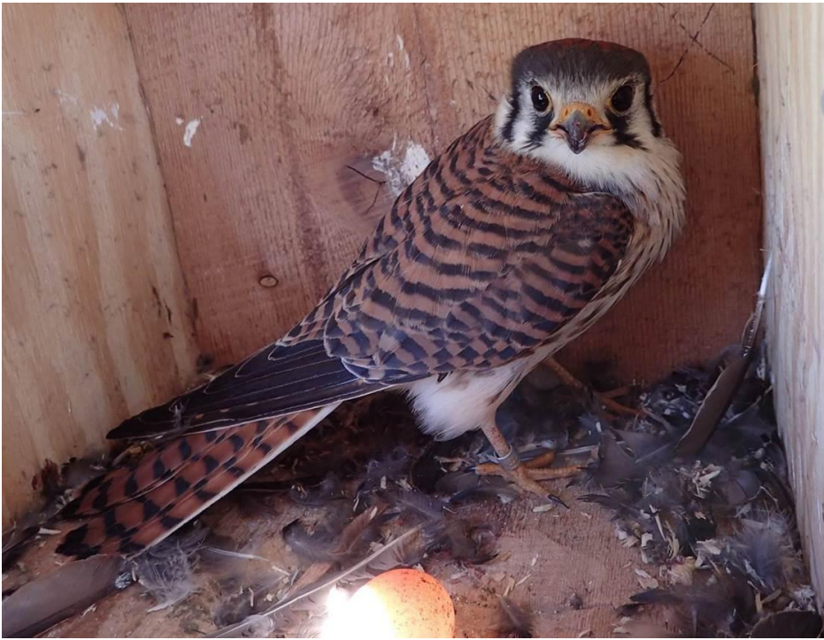
Banded female kestrel in box with one egg in depression on bare wood floor. Prey feathers scattered around. Three young fledged from this box.