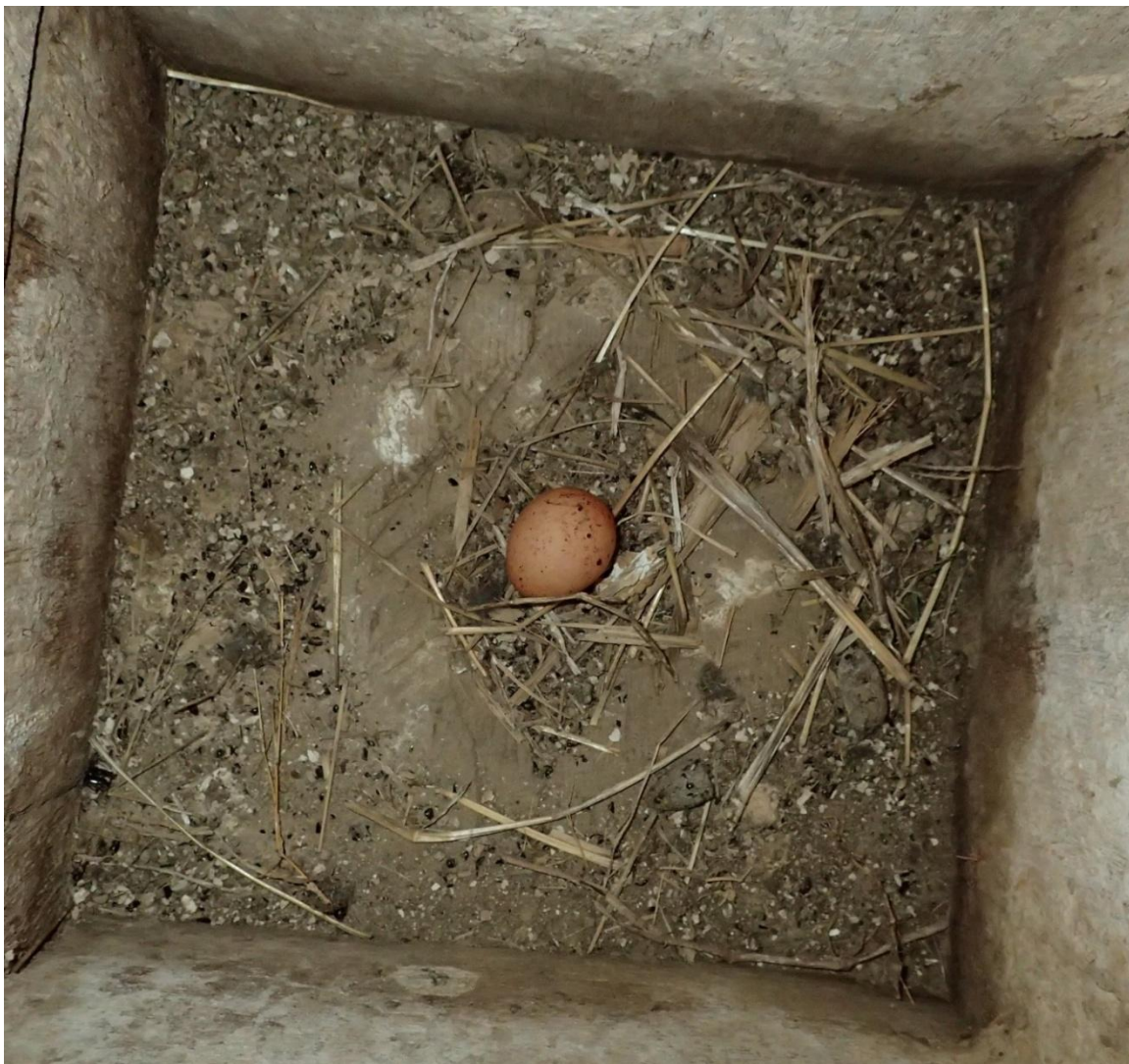
5 young fledged from this box