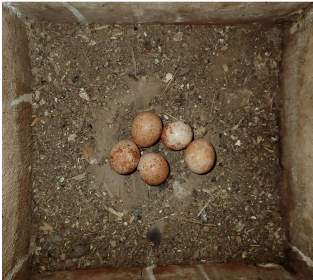
5 young fledged from this box.